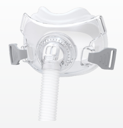
Circular dispersion ventilation system