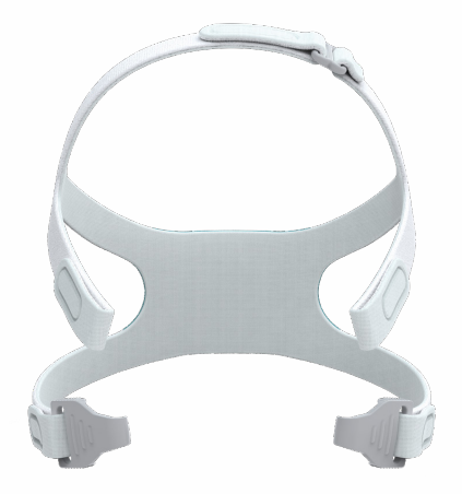
Equipped with innovative magnet- free clips