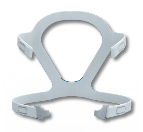
Equipped with innovative magnet- free clips