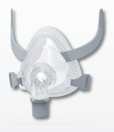
Circular dispersion ventilation system