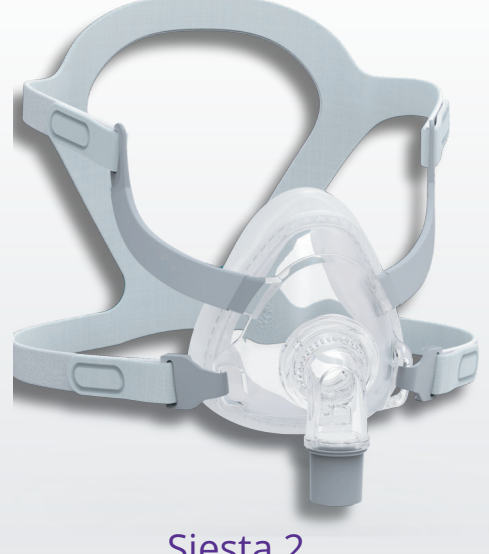
Siesta 2 Full Face Mask

The new and improved Siesta 2 Full Face Mask optimizes air flow and offers updated headgear and frame for increased comfort.